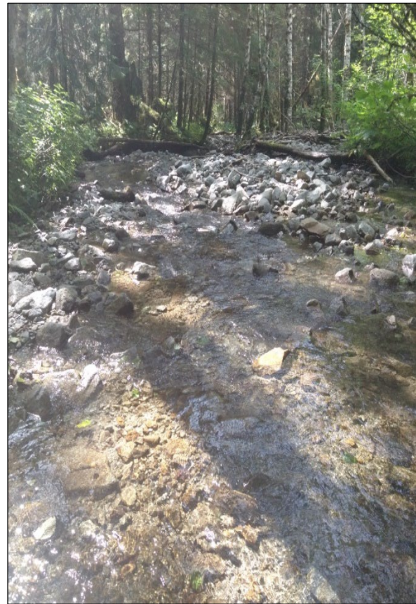
Figure 2. Downstream at waypoint 576.