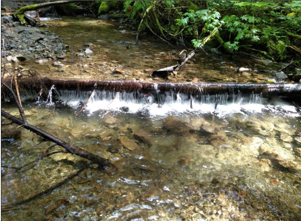
Figure 3. Log step at waypoint 574.