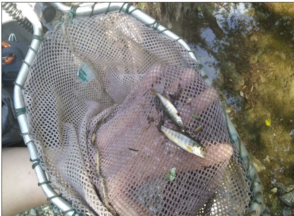
Figure 4. Juvenile coho salmon caught at waypoint 572.