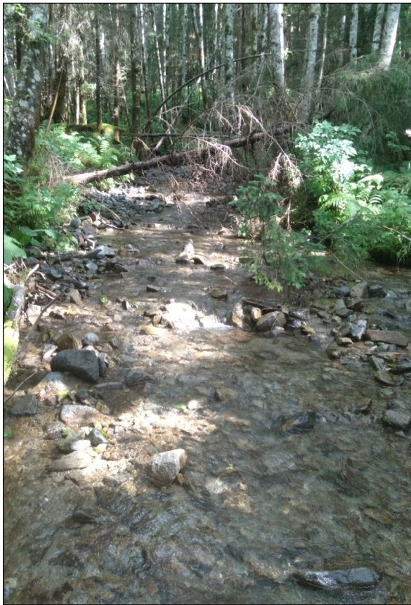
Figure 1. Upstream at waypoint 576.